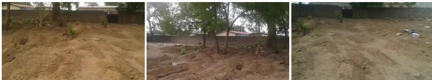
Recently disturbed earth by the southern gate of Gwange cemetery, Maiduguri. Witnesses saw BOSEPA staff bring bodies to the gate in a rubbish truck. These images show the likely site of grave. April 2016.

Mallam Babagana (not his real name) works by the side of the road a few hundred meters from the cemetery's southern gate. He told Amnesty International that since November 2015, a BOSEPA rubbish truck has visited the cemetery in the morning, two to three times a week.