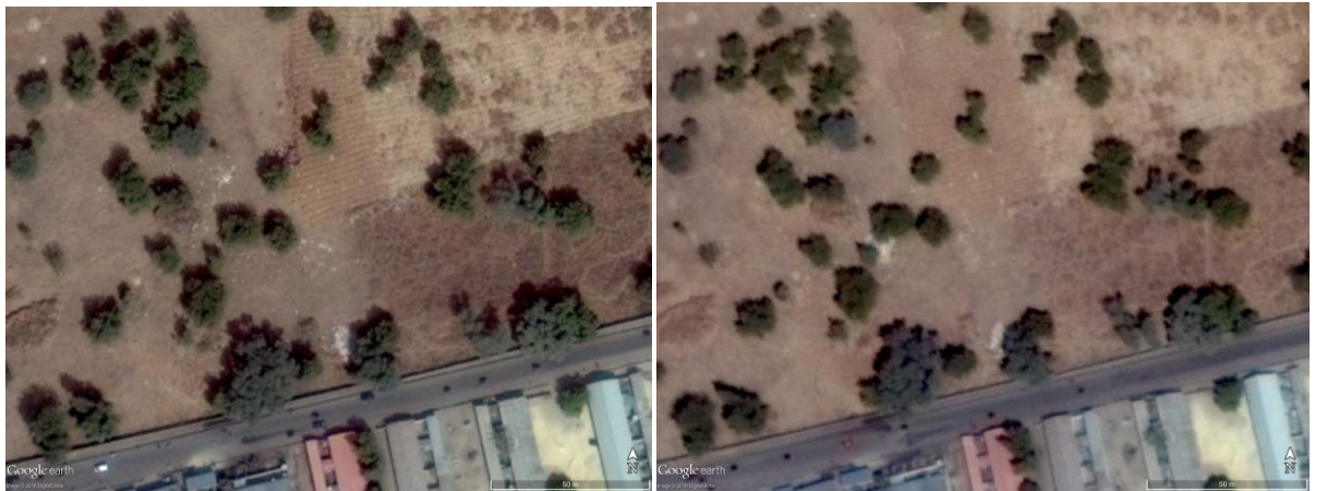
Satellite images show disturbed earth by the southern gate of Gwange cemetery, Maiduguri. These images were taken on 2 January and 17 February 2016.