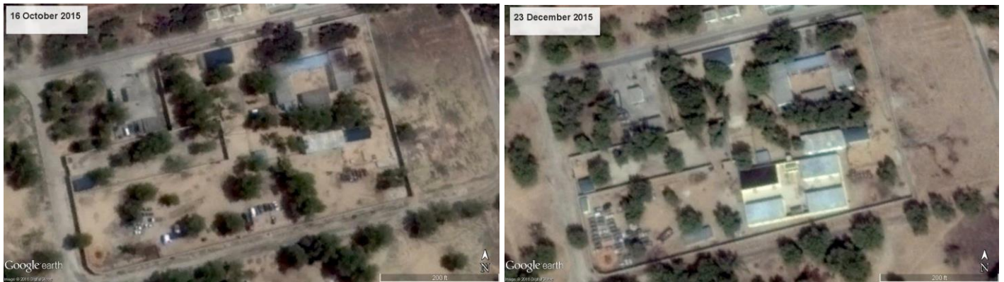
Satellite images show construction work in the detention facility at Giwa barracks between October and December 2015. These images correspond to the testimony of people detained in recently constructed cells in January 2016.