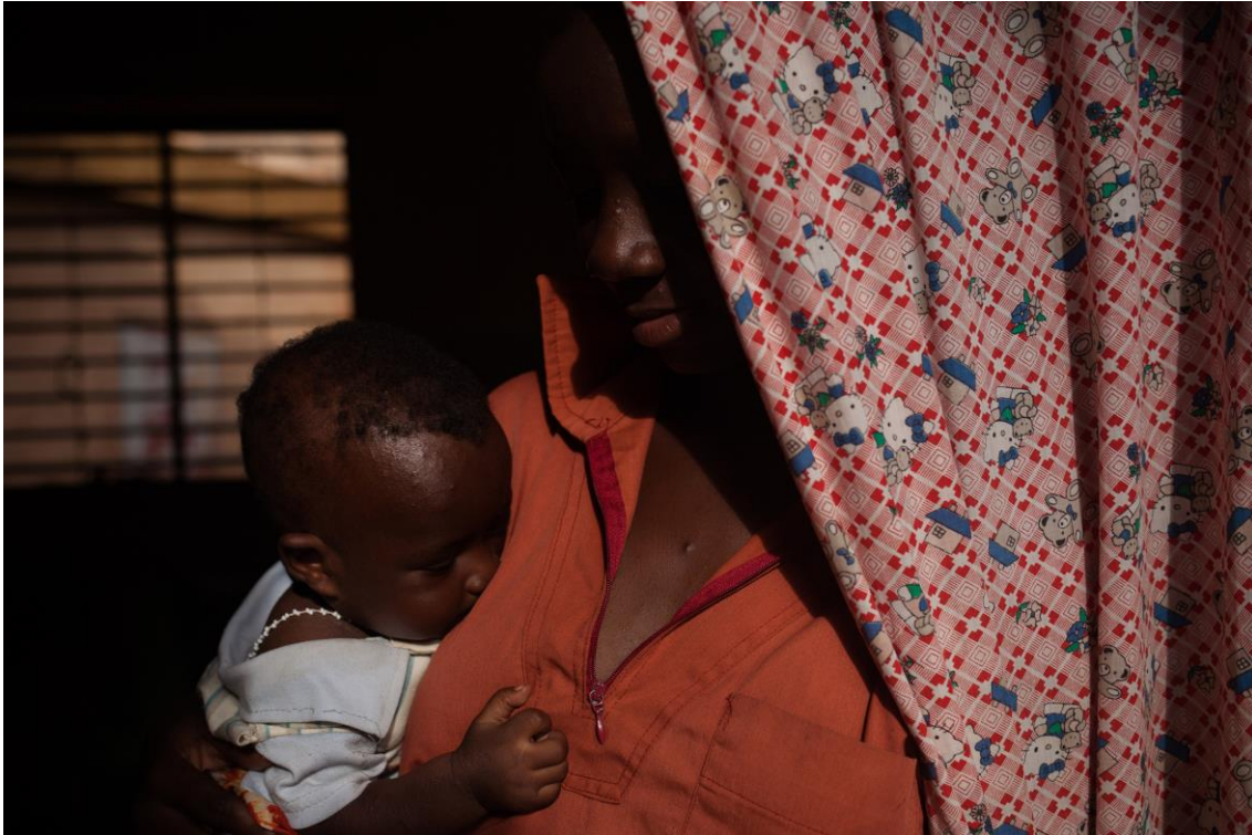
A shelter in Ouagadougou provides refuge to survivors of rape, early and forced marriage and unwanted pregnancy.

Burkina Faso has a rapidly growing population rate, estimated at 2.8% per year. The average number of children a woman has in her lifetime in Burkina Faso is 5.7. 75 This has gone down very slowly since 1993, when it was 6.9 per woman. 76