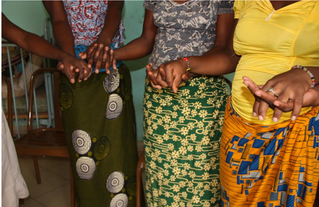
Young women hold hands in a shelter run by nuns in Ouagadougou, July 2014.