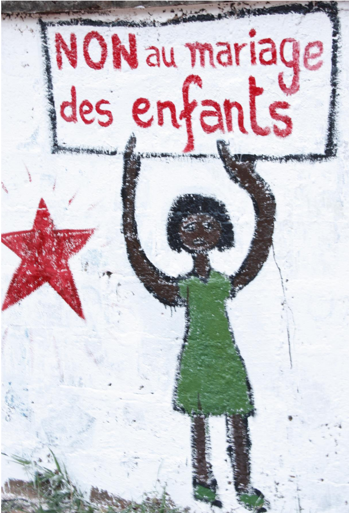
Painted wall in Bobo Dioulasso saying "No to child marriage" near the Maïa association which works on sexual and reproductive rights.