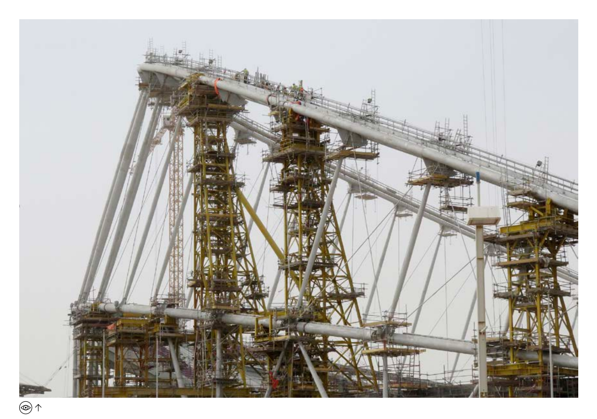
Workers constructing Khalifa Stadium arch. The majority of Khalifa Stadium workers Amnesty International spoke to were steel and metal workers, May 2015.

The Gulf state of Qatar has seen a dramatic economic transformation over the last two decades, fuelled largely by the growth of its oil and gas sector. The most visible sign of its transformation has been a massive increase in construction across the country. The 2022 Football World Cup, which FIFA awarded to Qatar in 2010, has been at the heart of Qatar's construction boom, prompting the building not just of stadiums but also of hotels and other infrastructure needed to facilitate tourism.<sup>1</sup>