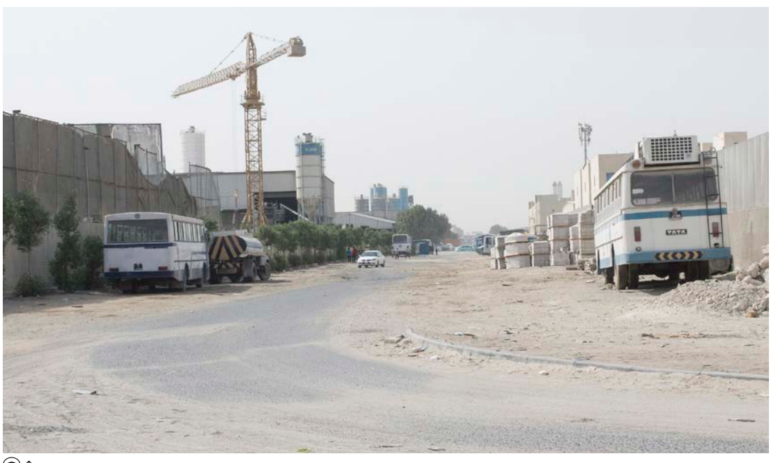
Thousands of migrant workers live in the Industrial Area, many in poor accommodation, May 2015.