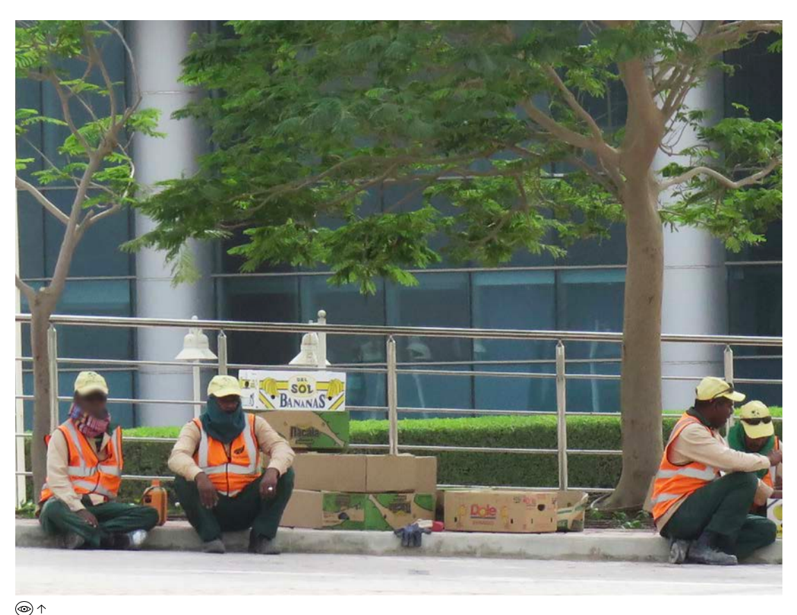
Nakheel Landscapes workers take a break from landscaping duties at the Aspire Zone, May 2015.

When Amnesty International first contacted Nakheel and raised allegations of labour exploitation the company stated that it was "deeply concerned by the serious allegations" but went on to say that it wanted "full disclosure" and that without this Nakheel denied the allegations. The information that Amnesty International provided to Nakheel is reflected in Chapter 3 of this report (the letters sent from the company are available at www.amnesty.org/en/document/mdd22/3681/2016/en). Amnesty International did not provide Nakheel or any other party with the names of the men interviewed, at their request, in order to protect them from reprisals.