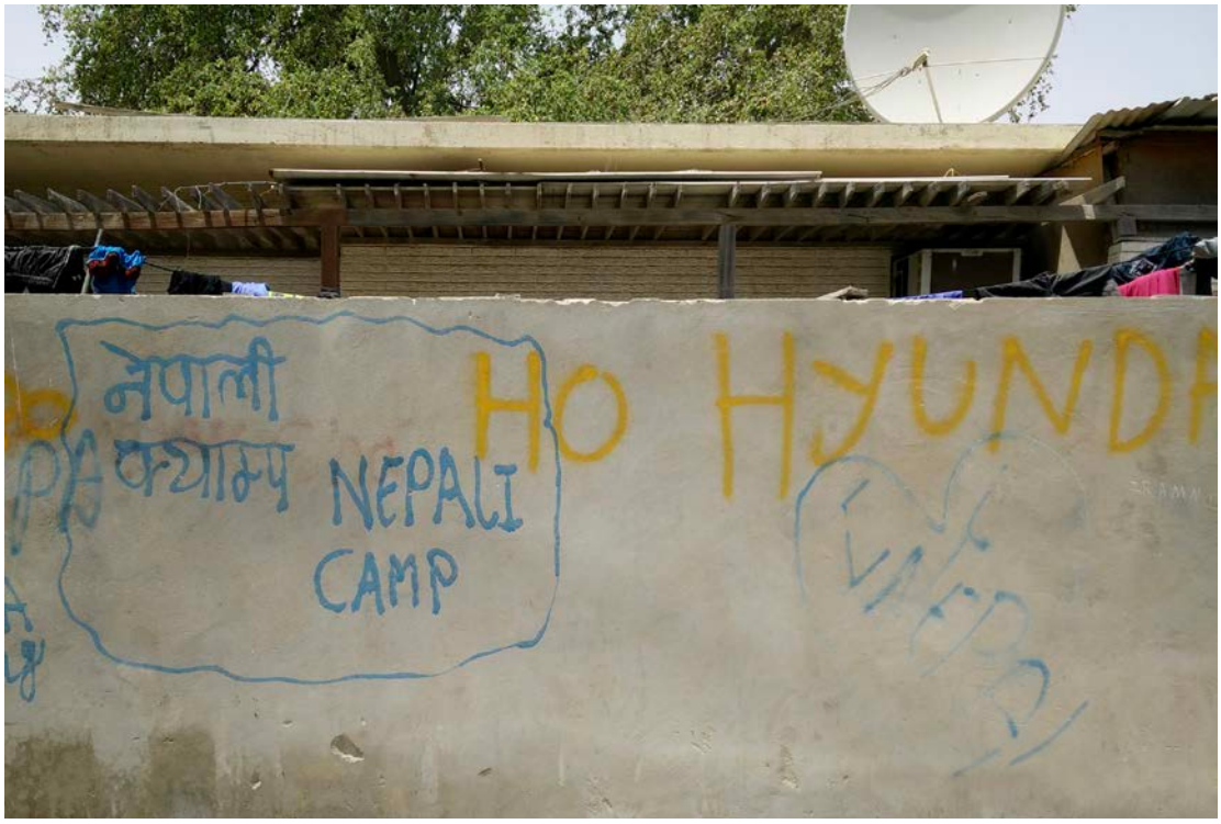
The main access road to the Al Wakrah camp which housed 98 of the men working on Khalifa Stadium who Amnesty International interviewed, May 2015. © Amnesty International

The exterior of one of the blocks in the Al Wakrah camp housing some of the migrant workers working on Khalifa Stadium. The Al Wakrah camp housed the majority of Khalifa Stadium workers Amnesty International interviewed, May 2015. © Amnesty International