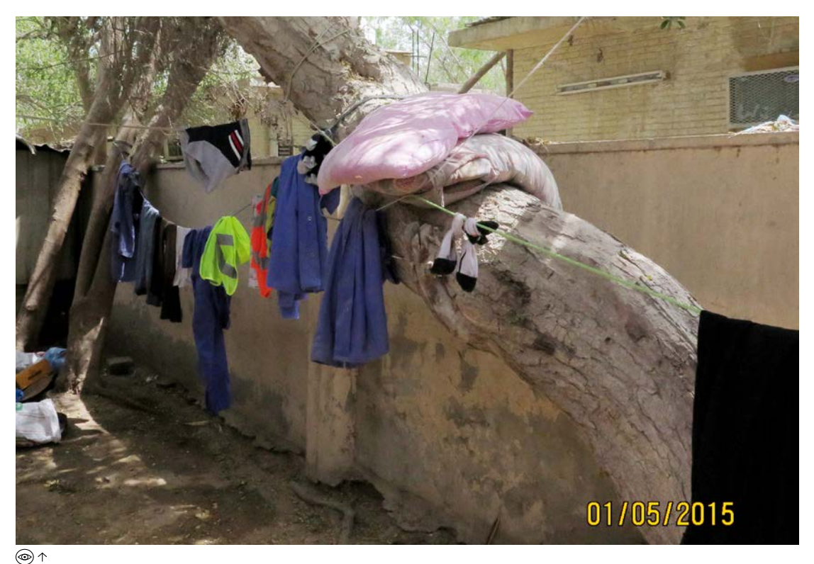
Photograph of Al Wakrah camp, an open area used by workers to dry clothes, May 2015.