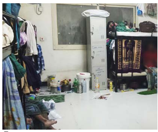
Bedrooms in the Nakheel Landscapes camp in the Industrial Area where eight or more workers slept in bunk beds, June 2015.

As noted in the last chapter, Amnesty International visited Labour City in February 2016. Conditions at this site are significantly better than the sites at the Industrial Area and Al Khor. However, the move to Labour City notwithstanding, the evidence gathered by Amnesty International clearly shows that the men working for Nakheel were living in substandard conditions while working on landscaping the Aspire Zone green areas. 174