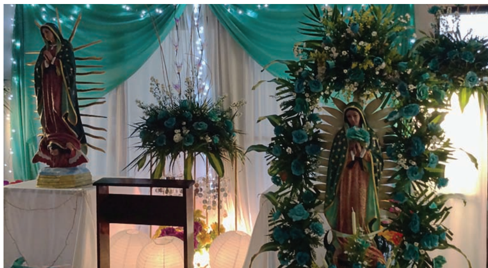
Altar with statues of the Virgin Mary in a public hospital, Veracruz, Mexico 2015.

This violence is inflicted on women and girls throughout the region by state agents who try to persuade them of, or in many cases impose, their own moral or religious beliefs or gender stereotypes. And they succeed in this by removing women's ability to decide for themselves, according to their own convictions and circumstances, what is best for them.