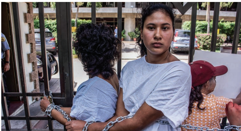
Women's rights activists protest in front of the Supreme Court, to demand the decriminalization of abortion, San Salvador, El Salvador, 15 May 2013.

There are many examples of these "other forms of violence" to which women are subjected. In turn, each of these forms generates a new violation of human rights such as the right to life, integrity and health, and to privacy and family life, among others; discrimination cuts across them all. The following section details some of the most representative examples from among the cases documented. However, these violations are systemic and widespread throughout the region.