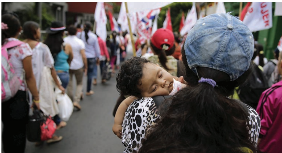
Demonstration to commemorate International day for the Elimination of Violence against Women, Asunción, Paraguay, 25 November 2015.

This is probably one of the cases that most starkly exposes the cycle of institutional violence to which women and girls are subjected by agents of the state. CEF first reported the possible abuse of Mainumby in January 2014 to the Municipal Council of Child and Adolescents Rights (Consejería Municipal de Derechos del Niño, Niña y Adolescente, CODENI), but no action was taken. 58 Although CODENI has a legal obligation to investigate and ensure protection in cases of child abuse, all state officials did was tell CEF that she should lodge a criminal complaint with the Public Prosecutor. On 20 January 2014, CEF lodged a complaint with the Public Prosecutor's Office, which opened an investigation that was dismissed on the basis that psychological assessments of the girl found no signs of abuse. 59 The Prosecutor did not follow any of the due diligence measures, set out in international human rights standards,