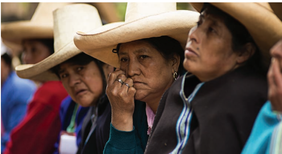
Members of the Women's Association of Huancabamba gather to discuss forced sterilizations, Huancabamba, Peru, October 2015.

measures to eliminate forms of discrimination, including treating men and women differently in order to overcome these inequalities. 142