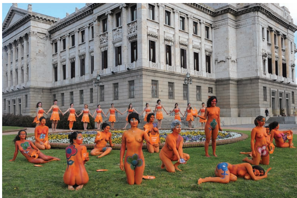
Women's rights activists protest in front of Parliament to demand the decriminalization of abortion, Montevideo, Uruguay, 25 September 2012.

The World Health Organization states that in the field of sexual and reproductive health, conscientious objection acts as a barrier to certain health services to which women have a right. 130 It emphasizes that in cases of access to abortion it is a unique barrier because it pits the right of a woman to life and health against that of the medical professional to act according to their conscience. This is because conscientious objection in health services seeks to challenge or change a rule or a public policy and has implications for the provision of health services and the protection of the rights of third parties. 131 In addition, conscientious objection in the fields of reproductive health tends to have discriminatory effects, because it affects almost exclusively or disproportionately women and girls of reproductive age.