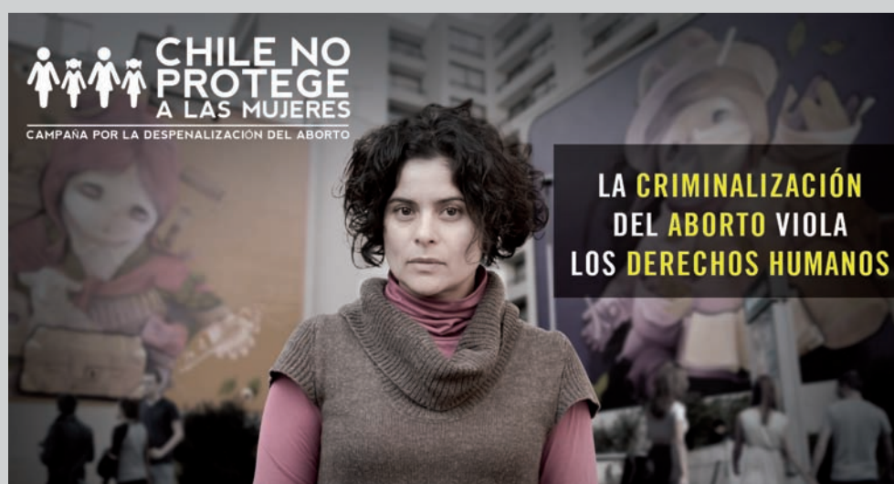
Image used by Amnesty International Chile for its campaign to decriminalize abortion.