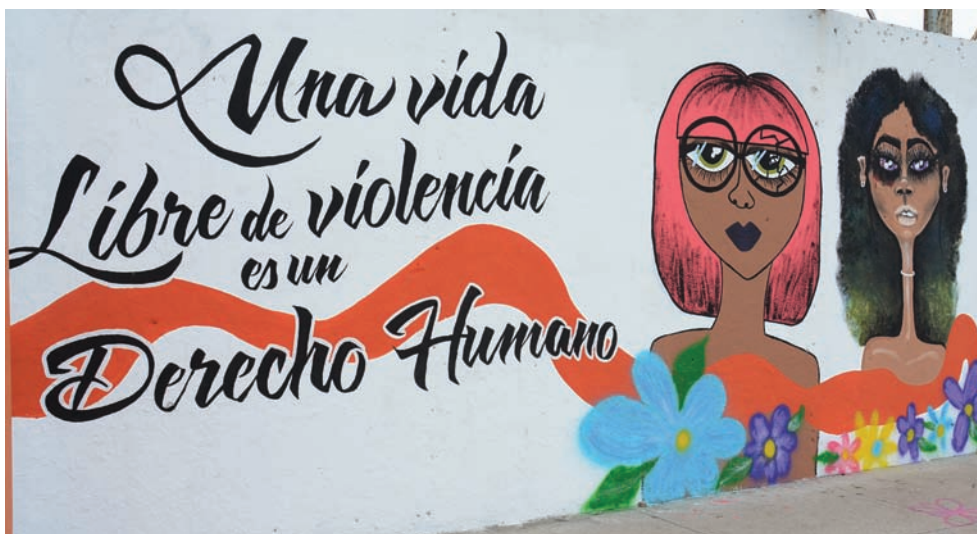
Mural created for International Day for the Elimination of Violence against Women. The mural reads: "A life free of violence is a human right". Veracruz, Mexico, 2015

In April 2015, the Public Prosecutor's Office reopened an investigation into the systematic practice of forced sterilization in the country as a grave violation of human rights. 44 At the time of writing, the investigation was continuing. In addition, in November 2015, the government began recording the names of victims of forced sterilization in order to provide them with psychological and medical support and to facilitate their access to justice, although so far, it has not provided them with comprehensive reparation. 45