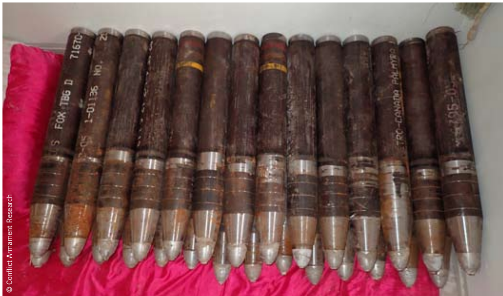
Improvised ground-to-ground rockets manufactured by IS forces and captured by Syrian Kurdish People's Protection Units in Kobane, documented by a Conflict Armament Research Field Investigation team on 21 February 2015 in Kobane.