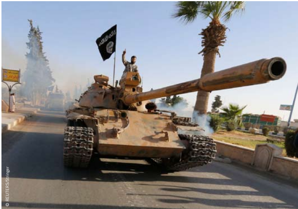
Islamic State fighters take part in a military parade in a captured T-55 tank along the streets of northern al-Raqqah province, Syria, 30 June 2014.

Additionally, during the current conflicts in Syria and Iraq, IS has captured hundreds of light armoured fighting vehicles of more than a dozen different types that were in service with the Syrian and Iraqi armies. However, the vast majority of light armoured fighting vehicles used by IS fighters comprise only a few models: the Russian BMP-1, MT-LB Infantry Fighting Vehicle, and the US M113A2 Armoured Personnel Carrier, M1117 Armoured Security Vehicle, and up-armoured HM-MWV (Humvee) variants.