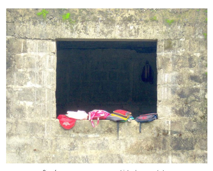
One of many emergency measures put into place as a strategy to reduce infection rates and get the spread of Ebola under control was to close borders and schools in June 2014. The schools remained closed from June due to the Ebola outbreak and re-opened on 14 April 2015.

Girls in Sierra Leone were particularly hit by the closure of schools between June 2014 and April 2015, one of many emergency measures put into place as a strategy to reduce infection rates and get the spread of Ebola under control.<sup>8</sup> With the Ebola crisis, girls also became more targeted for sexual violence including abusive and exploitative relationships. This trend was highlighted in a joint statement by expert organizations working in Sierra Leone in May 2015.