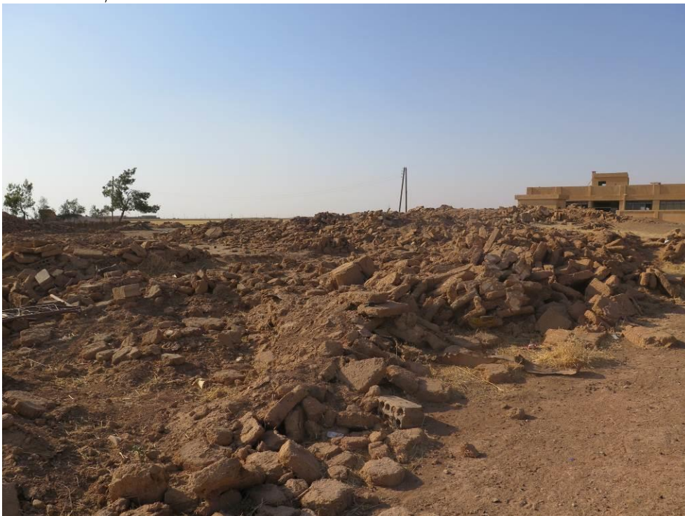
Some of the homes that were demolished in the village of Husseinia.

Amnesty International visited the Arab village of Husseinia in the Tel Hamees countryside in early August 2015. Villagers told Amnesty International researchers that nearly 90 homes in the village had been demolished, leaving only a single home still standing, and Amnesty International researchers saw the ruins of the destroyed homes during their visit. Satellite imagery of the village of Husseinia taken in June 2014 and June 2015 analysed by Amnesty International reflect that 225 buildings were standing in 2014, but that only 14 remained in 2015, a 93.8% reduction in one year. The destruction reflected in the satellite imagery is not consistent with shelling but rather the demolition of the village. Residents said the YPG carried out the demolitions in February 2015, displacing most residents to nearby villages and to the city of Qamishli. Some Husseinia residents remained in the village, living in a school that had not been destroyed.