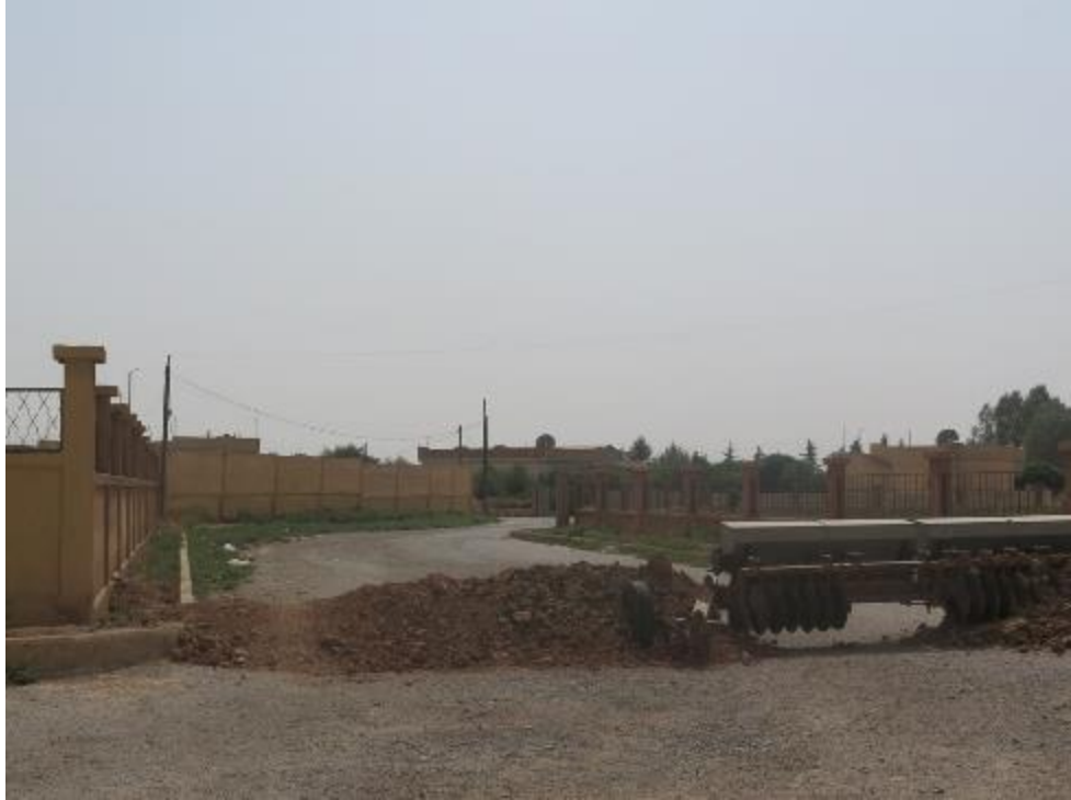
The entrance to Hammam al-Turkman blocked by a barrier placed by the Autonomous Administration, 30 July 2015.

In the nearby village of Hammam al-Turkman residents were gathered into the local school by the YPG and told they had to leave the area.