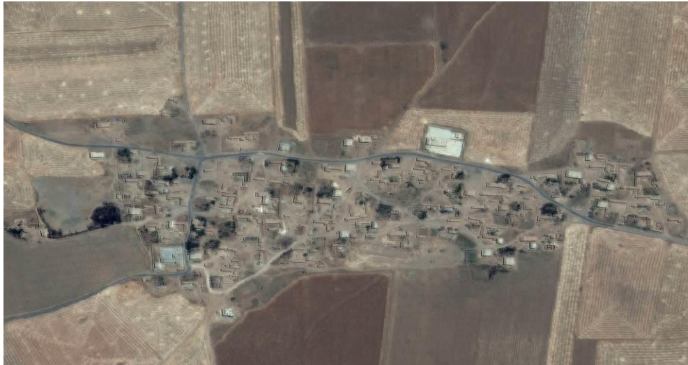
Satellite imagery the village of Husseiniya taken on June 2014. ©CNES 2015, Distribution AIRBUS DS, June 2014.