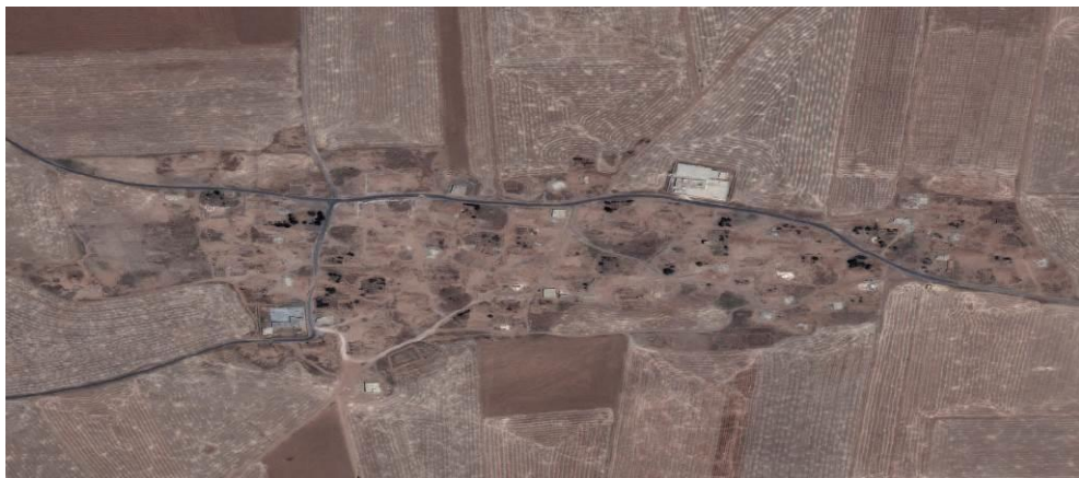
Satellite image of the village of Husseiniya taken on June 2015 reflects that almost the entire village has been razed.

Residents said that the village came under the control of the Free Syrian Army (FSA), an armed opposition group, in February 2013. A local Arab official from the Tel Hamees countryside said that the YPG first clashed with the FSA and other non-state armed groups in the Tel Hamees countryside in December 2013, and that the biggest confrontation between the FSA and the YPG took place in the village of Husseiniya in February 2014. 3 The official said that at that time, a number of armed groups, including Ahrar al-Sham, Liwa' 114,