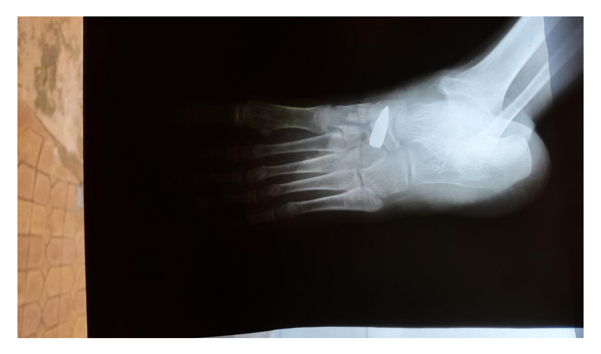
Figure 3: X-ray showing the bullet lodged in Rouguiatou Baldé's foot.

Her family did not file a complaint as they told Amnesty International they could not trust the police or the authorities to follow-up on the complaint.