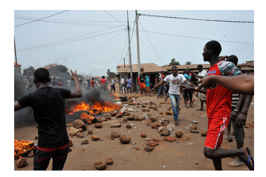
Figure 1: Demonstrators setting-up a road block with burning tyres and rocks in Bomboli, Conakry, on 13 April 2015.

This sequence of events is consistent with the information that police officers provided to Amnesty International about their operations to maintain public order in April and May 2015. They said the authorities consider demonstrations, of which they have not been notified as "non-authorized".<sup>8</sup> When opposition groups call for protests in the media, the police post officers and anti-riot equipment on demonstration sites to prevent non-authorised gatherings. They approach demonstrators to disperse them, then pursue and arrest those who participate or engage in criminal behaviour. Police officers acknowledged that force may be used at any point of during this process. Even after the assembly is dispersed they may continue pursuing protestors, collaborating with mobile patrols to chase them in their neighbourhoods and into their homes.