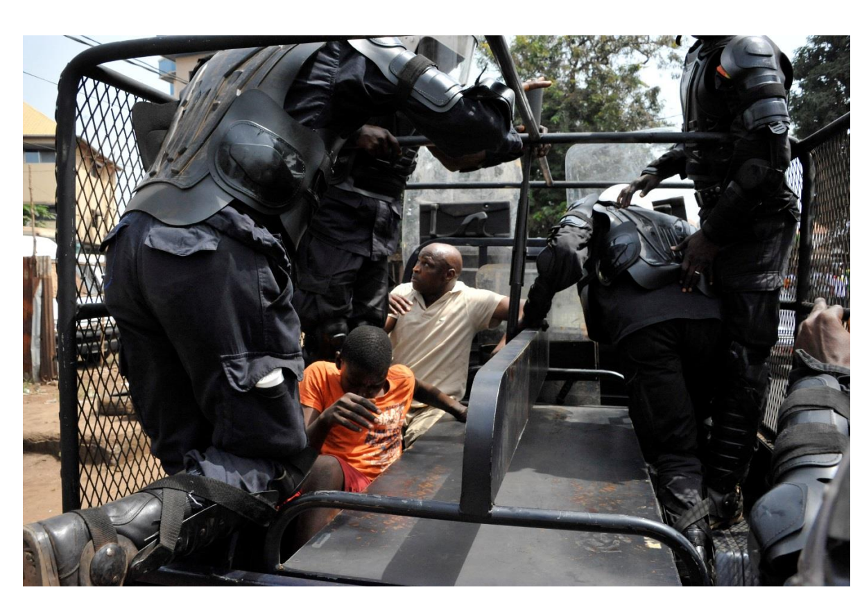
Figure 4: Two demonstrators arrested by Police officers in anti-riot gear in Dixinn, Conakry, on 14 April 2015.

Under Guinea's Criminal Code, refusing to disperse from an assembly when ordered to do so by the competent authority is a crime which carries a prison term of two to three years, in addition to the possible suspension between one to five years of other civic rights, such as the right to vote or to be elected to a public office or to work in public administration.<sup>34</sup>