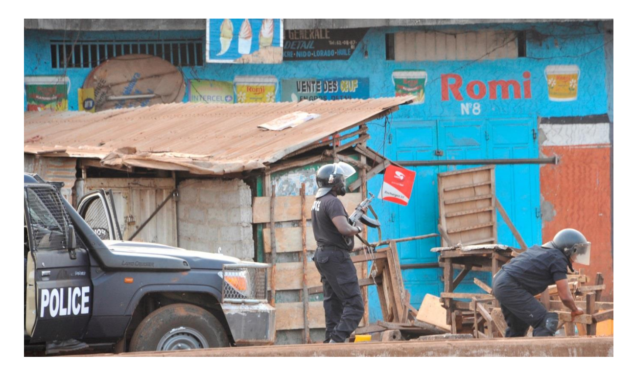
Figure 2: Police officer carrying a firearm during a demonstration in Ratoma, Conakry, on 13 April 2015.

The accounts of the police and the protestors differ on who first used force and how it was used. On the one hand, police officers told Amnesty International that security forces used force when protestors ignored their injunctions to disperse and started throwing stones. They clarified that the security forces taking part in operations to maintain public order only used anti-riot equipment, namely tear gas and batons. They insisted that they were not authorised to carry or use firearms, and that it was the responsibility of the commanding officer of the units deployed to ensure that the officers under his/her command complied with this rule. However, the police officers also noted that mobile patrols which are called to pursue and arrest protestors, such as the Anti-Crime Brigade and other specialised units, may carry firearms.