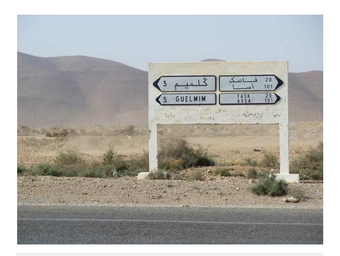
Photo: Junction between Gulemim and Assa, southern Morocco, where reports of protesters being tortured and otherwise ill-treated following arrest by gendarmes and police in September 2013 emerged.

"He was full of bruises. He told me they tortured him the night he was arrested, until he signed, although he was innocent. When he resisted signing, they threw water on him and gave him electric shocks. We went to the police station at the time, but they wouldn't let us see him."