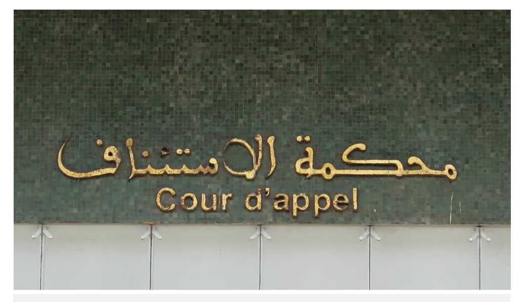
Photo: Agadir Court of Appeals whose landmark ruling in August 2014 overturned a conviction based on a torture-tainted police interrogation report.

In a rare decision, the Criminal Chamber of the Agadir Court of Appeals quashed a guilty verdict for drugs charges against a detainee who alleged torture, in August 2014. The court granted a medical examination which was performed in the Guelmim military hospital. It concluded that he had been tortured in garde à vue detention including though beatings, blows to the head that perforated his eardrum, and cigarette burns, following his arrest in Guelmim in June 2014. Authorities announced an investigation into the alleged torture, and have yet to make conclusions public.