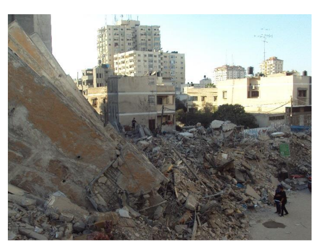
Al-Basha Tower in Gaza City, Gaza Strip, August 2014

"His face was very pale and he was very frightened. He said he had just received a call [from the Israeli army] that the tower had to be evacuated and that it would be targeted in 20 minutes. I didn't know what to save; we had to wake up all the people sleeping upstairs."<sup>47</sup>