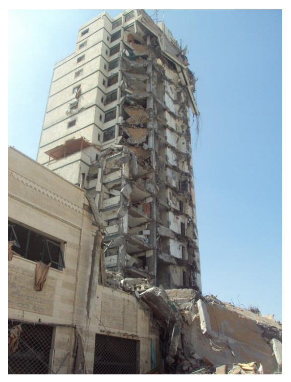
Italian Complex in Gaza City, Gaza Strip, August 2014

On 25 August 2014, at about 12.05am, an Israeli aircraft launched a number of bombs at the Italian Complex, built in a joint venture with an Italian company. Munitions experts consulted by Amnesty International identified one of the bombs as probably a Guided Bomb Unit (GBU) equipped with a Joint Direct Attack Munitions (JDAM) system.<sup>36</sup> The complex, which contains a 16-storey tower with a commercial centre on the two bottom floors, was severely damaged when all the floors on one side of the tower collapsed.